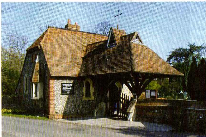
Church Lodge Clewer, the home of Clewer Museum