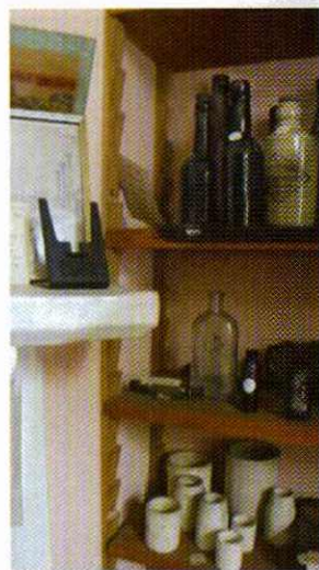
Two views inside the museum taken just before it closed